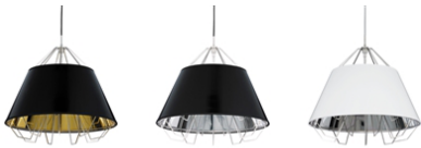
gloss black / gold shade