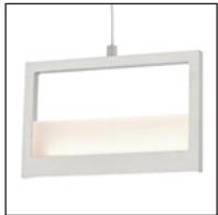
BN - Brushed Nickel