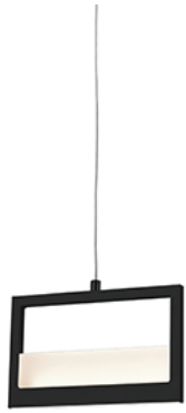
BK - Black