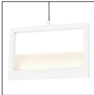
WH - White