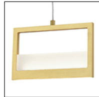
BB - Brushed Brass