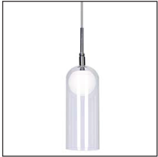
CH - Chrome