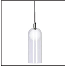
BN - Brushed Nickel