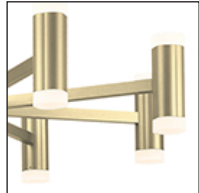
BB - Brushed Brass