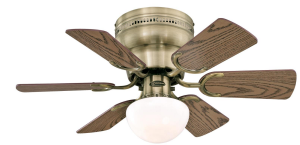
Reversible Oak Finish Blades