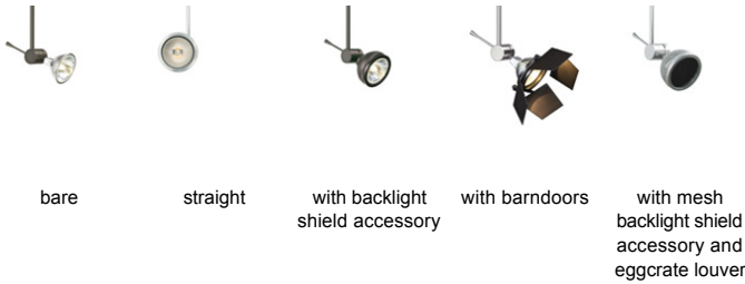
bare straight with backlight shield accessory with barndoors with mesh backlight shield accessory and eggcrate louver