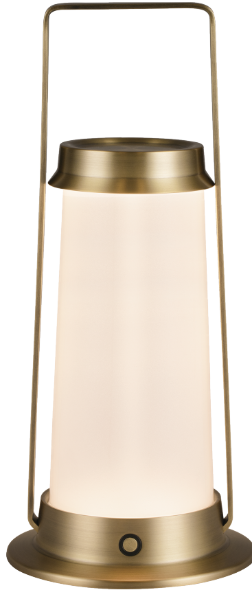
PT140976-AB Built-in Rechargeable Battery, Portable