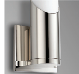
-24 Satin Nickel