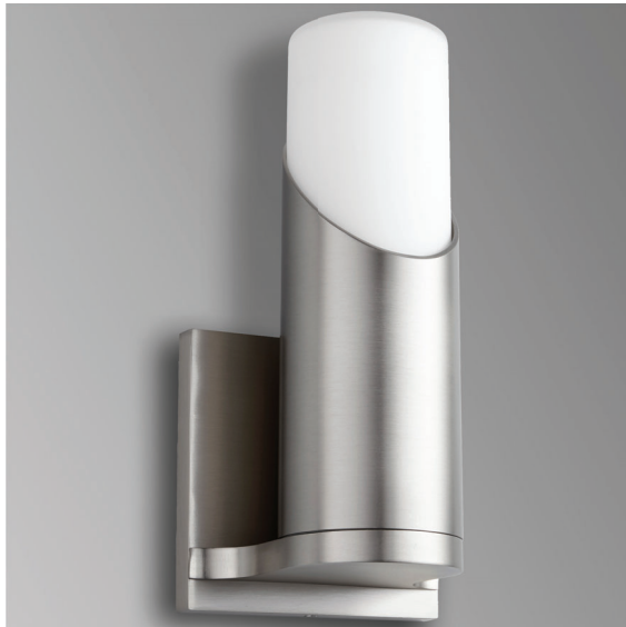
-24 Satin Nickel