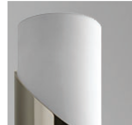
-2 Matte White Acrylic