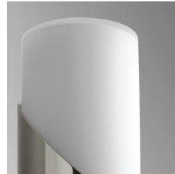
-1 White Opal Glass