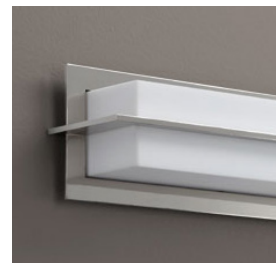
-20 Polished Nickel