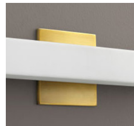
-40 Aged Brass

LIGHT SOURCE 1 x 11.7W LED, 3000K, CRI 90 LUMINAIRE POWER 14.1W at 120V RATED LIFE 60000 hr RL OPTIONAL COLOR TEMPERATURES 2700K, 3500K, 4000K LUMEN OUTPUT Delivered: 1258 lm (LM-79) INPUT VOLTAGE 120V to 277V AC, 50/60Hz DRIVER OUTPUT 350mA, 14.7W max power DIMMING TRIAC and ELV dimming at 120V AC; 0-10V dimming, 100% to 1% current output CONSTRUCTION Plated Steel and Acrylic DIFFUSER - Matte White Acrylic FINISHES Oiled Bronze (-22), Satin Nickel (-24), Aged Brass (-40) MOUNTING 4" Octagonal J-Box STANDARDS UL Dry/Damp listed, ADA Compliant, Conforms to UL STD 1598, Certified CAN/CSA STD C22.2 No 250.0.