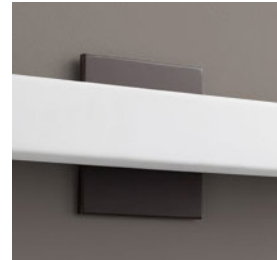
-22 Oiled Bronze