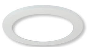
Decorative Ring for ELO+

NLOCAC-6RCH 6" Chrome NLOCAC-8RCH 8" Chrome NLOCAC-11RCH 11" Chrome Seamlessly attaches to luminaire. Compatible with ELO+ only.