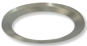
Decorative Ring for ELO+

NLOCAC-6811RECKIT Allows luminaires to mount over 5" or 6" recessed housings with torsion spring brackets.