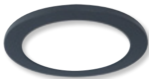
Decorative Ring for ELO+

NLOCAC-6RB 6" Black NLOCAC-8RB 8" Black NLOCAC-11RB 11" Black Seamlessly attaches to luminaire. Compatible with ELO+ only.