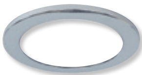
Decorative Ring for ELO+

NLOCAC-6RBN 6" Brushed Nickel NLOCAC-8RBN 8" Black NLOCAC-11RBN 11" Black Seamlessly attaches to luminaire. Compatible with ELO+ only.