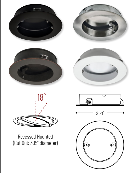
NMP-AREC Recessed Flange Accessory