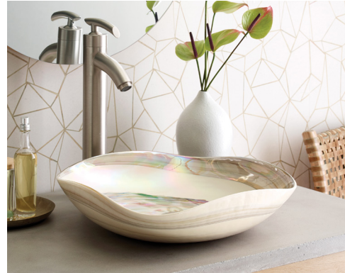
Shown in Abalone