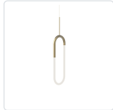
PD95108-NB Natural Brass