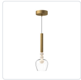
PD30501-BG/CL Brushed Gold/Clear