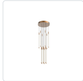
MP75121-VB Vintage Brass