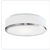
FM6012-BN-5CCT Brushed Nickel