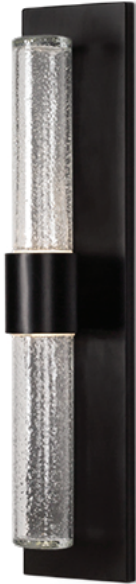
BK - Black