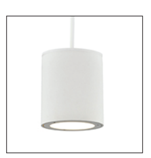
WH - White