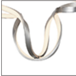
AS - Antique Silver