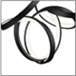
BK - Black