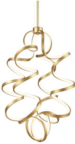
AN - Antique Brass