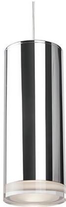
CH - Chrome