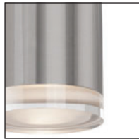
BN - Brushed Nickel