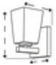
Image File Name: P5044-077.jpg