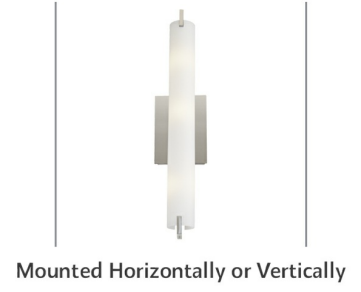
Mounted Horizontally or Vertically