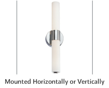
Mounted Horizontally or Vertically