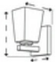
Image File Name: P5042-077-L.jpg