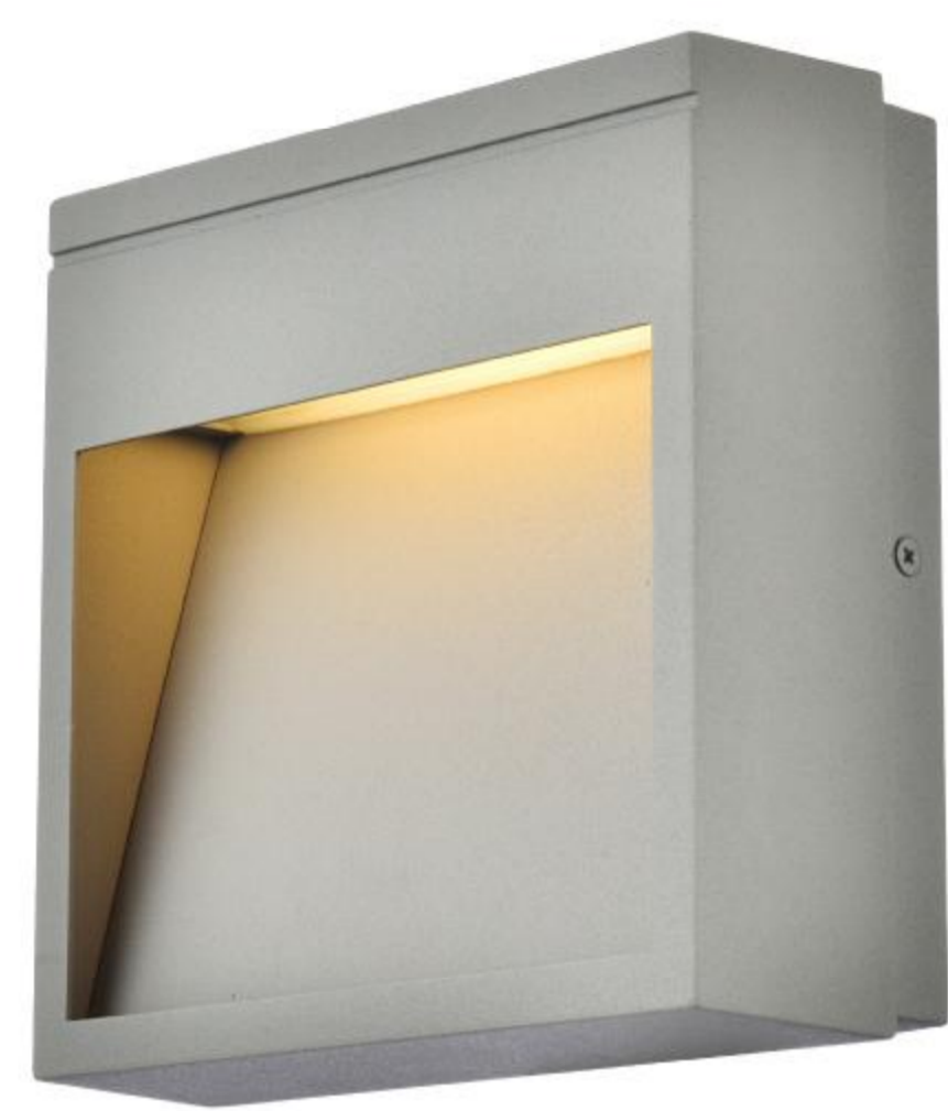
Silver Item No:LDOD4019S