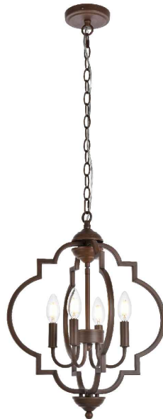
Wooden Item No:LD7064D16WOK