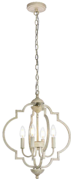
Weathered Dove Item No:LD7064D16WD