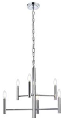
Chrome Item No:LD7060D22C