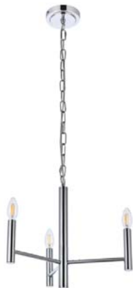
Chrome Item No:LD7059D17C