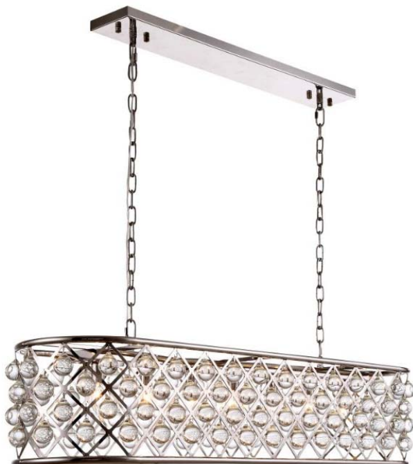
Polished Nickel Item No: 1215G50PN