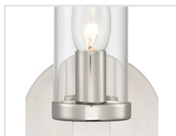
PNCG Polished Nickel Clear Glass

*For complete warranty terms, please visit: www.aloralighting.com/warranty