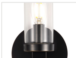
UBCG Urban Bronze Clear Glass