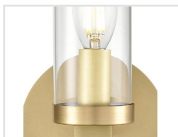
NBCG Natural Brass Clear Glass